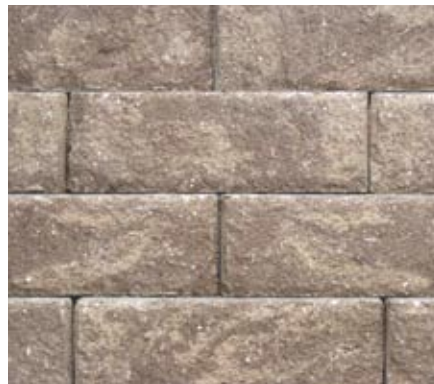
JAMES RIVER RANGE